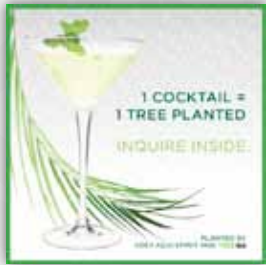
TREEtini Cling (4" x 4")

Make consumers aware of your eco-friendly efforts before they even step foot in your account.